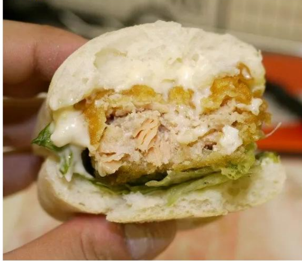
3. Kentucky Fried Salmon