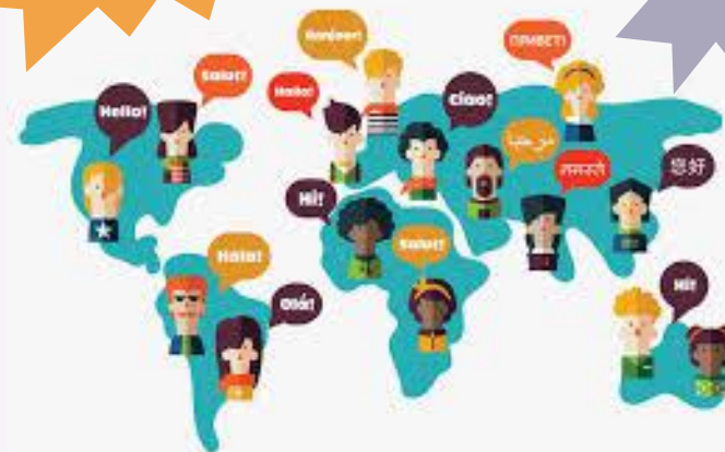
understanding the global environment