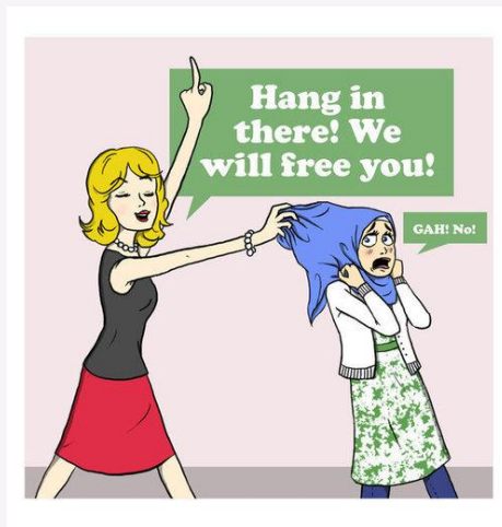
change our perspective into a global perspective